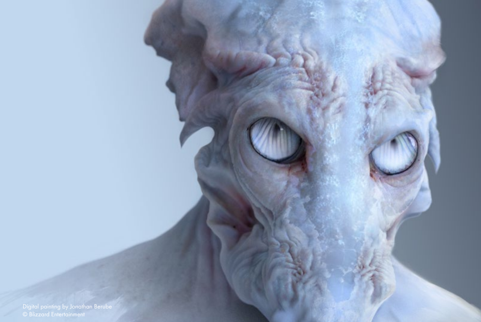
Digital painting by Jonathan Berube