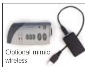
Optional mimio wireless