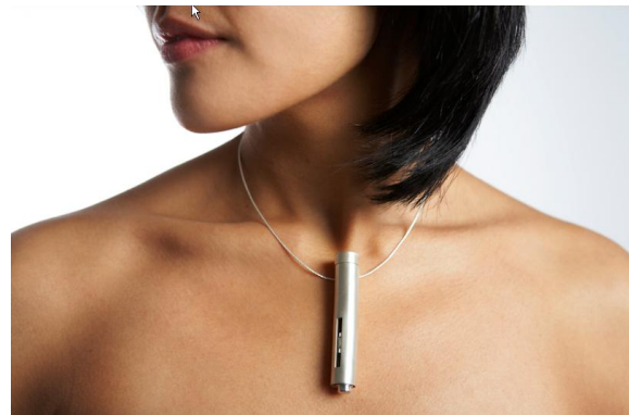
Leah Hesse: Therapeutic Object Design.